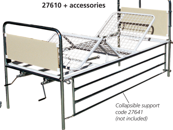
27610 + accessories