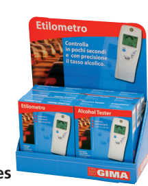
Counter display fits 6 tester

Large display to read exact value of your breath (3 colour backlight)